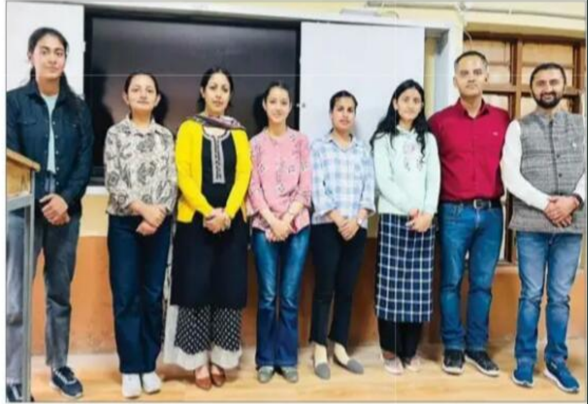
शिमला। संजौली कालेज में नोबेल पुरस्कार पर चर्चा के बाद सामूहिक चित्र में छात्र