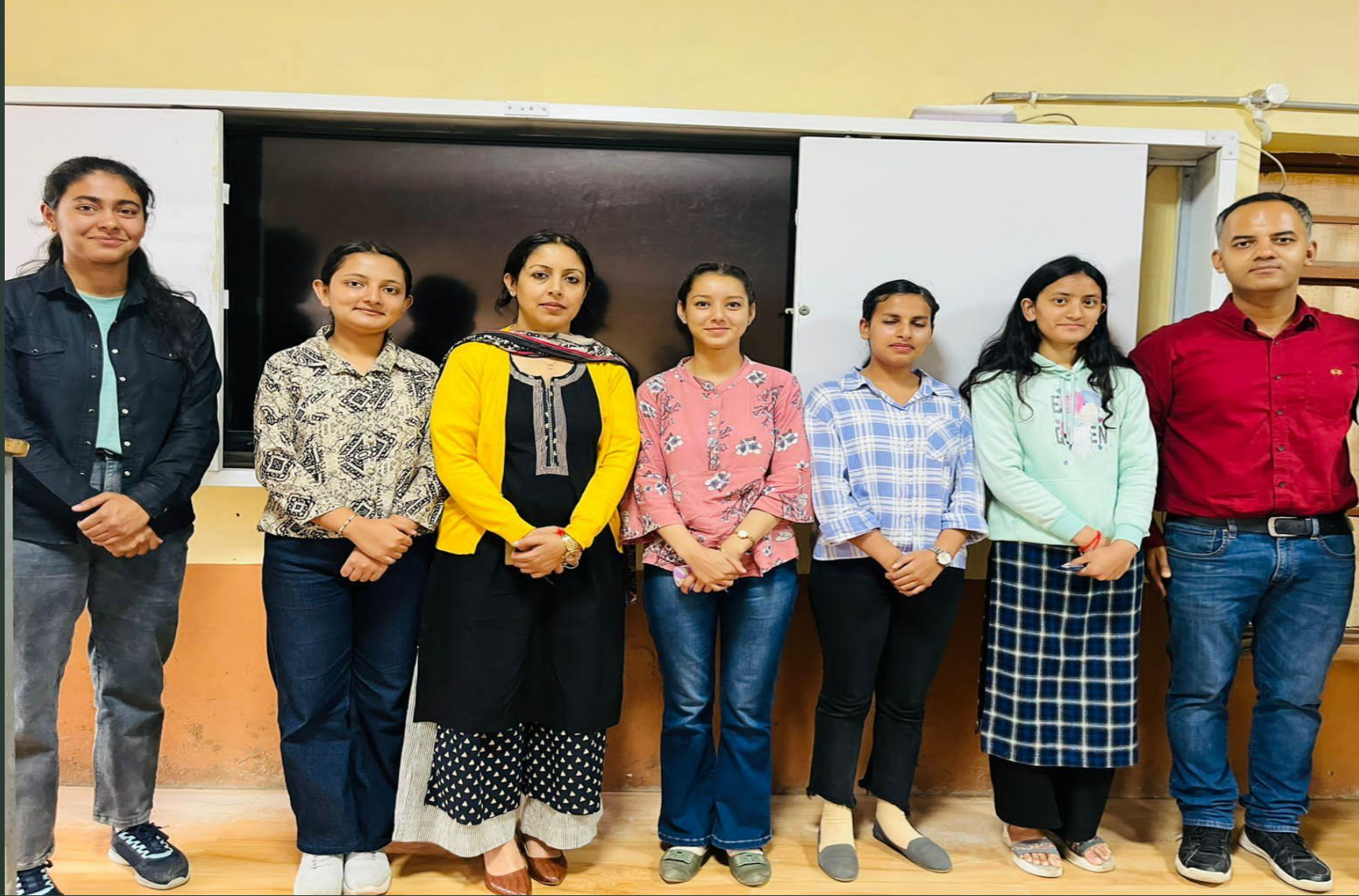
Team Members with Chief Advisor and Head of the Department.